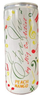
ÈTRE VU PEACH MANGO