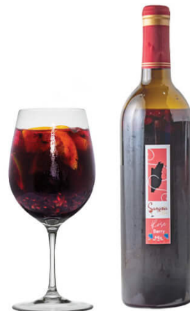
DIFFERENT FLAVOURS AVAILABLE (10oz & 24oz BOTTLE)