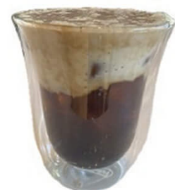
BANANA CREAM ICED COFFEE ($12)