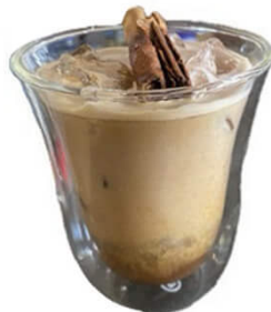
ICED BROWN SUGAR SHAKEN ESPRESSO WITH CINNAMON SPICED OATMILK ($9)