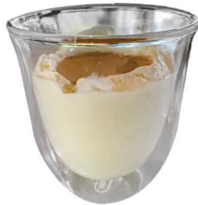
REVERSED AFFOGATO ($13)