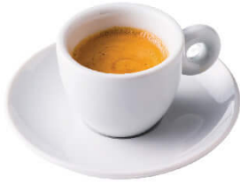
ESPRESSO (HOT-$6 / ICED-$7)