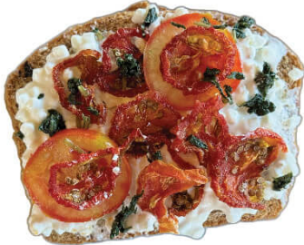
RICOTTA & BASIL SUNDRIED TOMATO