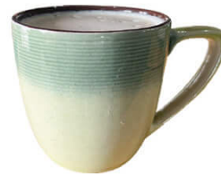
BABYCCINO (HOT-$5 / ICED-$6)