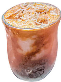
COCO CAFE ($12)