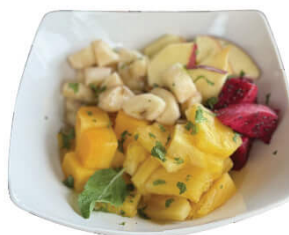
FRUITBOWL ($16) WITH YOGHURT ($18)