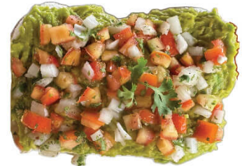
RICOTTA, AVOCADO & PICO DE GALLO

CHOICE OF TOAST: WHITE, WHEAT OR MULTIGRAIN BREAD