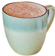
HOT CHOCOLATE (regular / white) (HOT-$8 / ICED-$9)