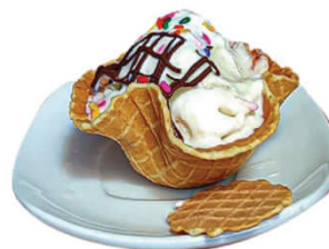
KIDS SUNDAE ($9)