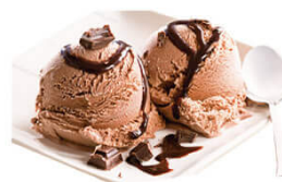
CHOCOLATE BOMB ($15)