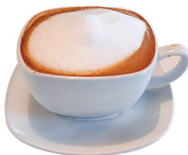
CAPPUCCINO (HOT-$9 / ICED-$10)