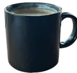
AMERICANO (HOT-$8 / ICED-$9)