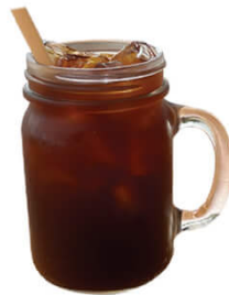
COLD BREW (ICED-$8)