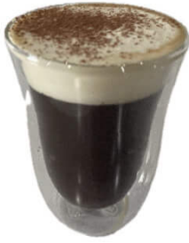
IRISH COFFEE ($24) (WHISKEY)