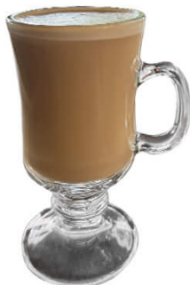
VIETNAMESE COFFEE (HOT-$12 / ICED-$13)