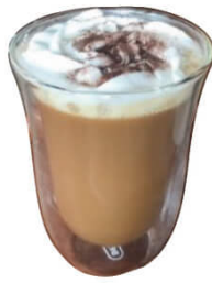
ITALIAN COFFEE ($24) (AMARETTO DISSARONO)