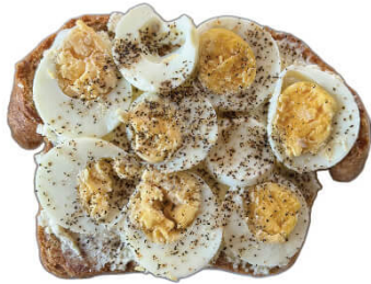
RICOTTA & BOILED EGGS