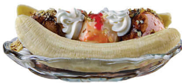
BANANA SPLIT ($15)