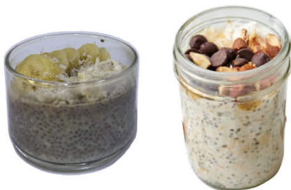
CHIA PUDDING / ROLLED OATS