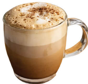
DIRTY CHAI (HOT-$12 / ICED-$13)