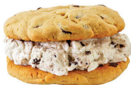
ICE CREAM SANDWICH ($13)