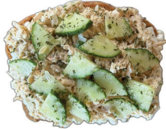
CREAM CHEESE, TUNA & CUCUMBER