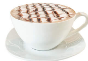
MOCHA (HOT-$10 / ICED-$11)