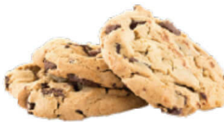
CHOCOLATE CHIP / OATMEAL RAISIN COOKIES