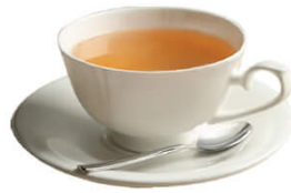
TEA (HOT-$6 / ICED-$7) (ASK AVAILABLE FLAVORS)