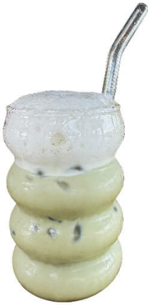
MATCHA LATTE (HOT-$14 / ICED-$15)