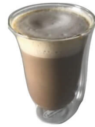
BAILEYS COFFEE ($24)