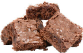
BROWNIE PLAIN / NUTS / CHEESECAKE