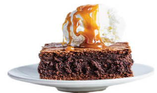
BROWNIE TOPPED WITH ICE CREAM ($12+)