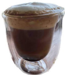
TRADITIONAL MACCHIATO (HOT-$8)