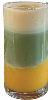
FRUIT MATCHA LATTE ($15) (STRAWBERRY / MANGO / PINEAPPLE)