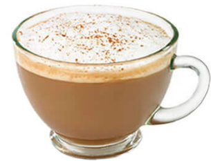
VANILLA BROWN SUGAR CINNAMON LATTE (HOT-$11 / ICED-$12)