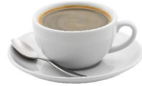
LUNGO (HOT-$8 / ICED-$9)