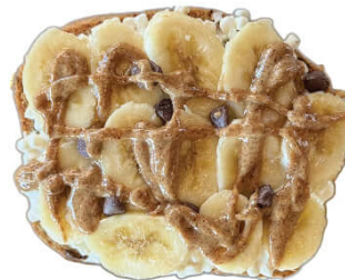
COTTAGE, BANANA & ALMOND BUTTER