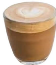
CORTADO (HOT-$9 / ICED-$10)