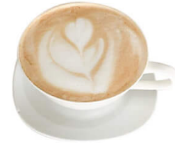
LONDON FOG (HOT-$7 / ICED-$8) (Lavender optional)