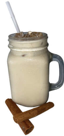
HOMEMADE HORCHATA (ICED-$7)