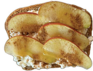
COTTAGE CHEESE, APPLE & CINNAMON