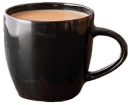
CHAI LATTE (HOT-$9 / ICED-$10)