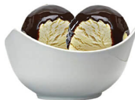
DAME BLANCHE ($15)