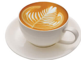
LATTE (HOT-$10 / ICED-$11)