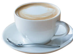
FLAT WHITE (HOT-$10 / ICED-$11)