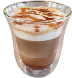
FLAVORED MACCHIATO (HOT-$10+ / ICED-$11+)